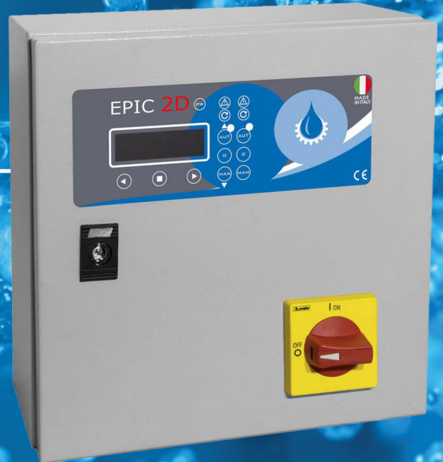
30cm x 30cm x 14.5cm (excluding isolator switch)